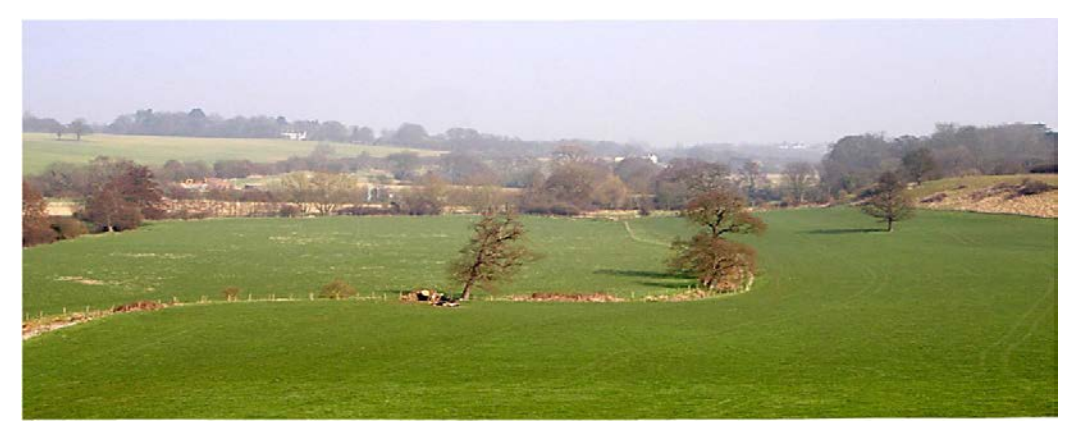
View from Widford Church along the Ash Valley north of Widford